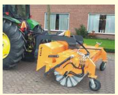
Tractor rear mounting