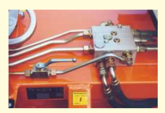
All units needed are contained within the specially-designed control block: Pressure release valve, run on safety valve, flow switching valve for collector, connection for side brush