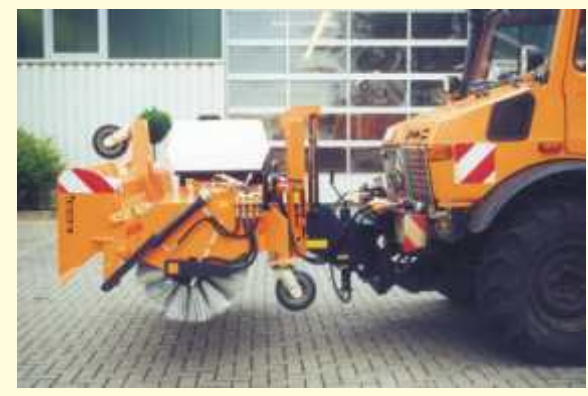
Unimog-Truck lift attachment