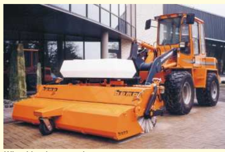
Wheel loader mounting