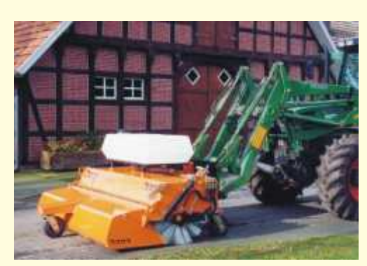
Tractor front loader mounting