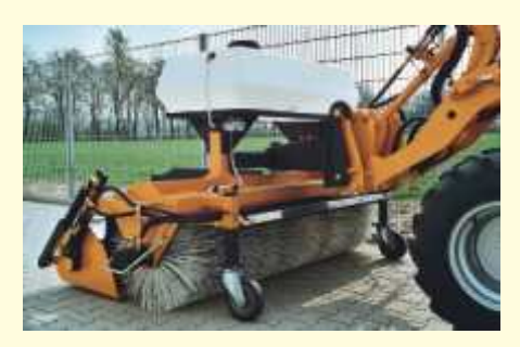
bema 25 complete (with quick change to wheel loader, water spray system 240 ltr., hydraulic side brush). Only one reversible hydraulic service is necessary for all functions.