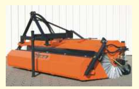
bema 25 tractor mounting attachment with 3 point rear mounting (hydraulic waste collection (container)