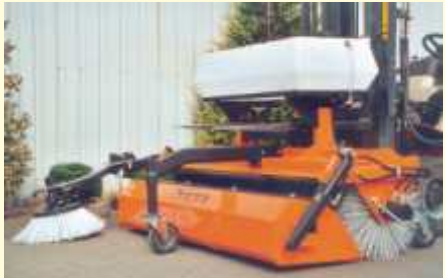
bema 25 complete with forklift attachment, water spray system 240 ltr., hydr. side brush, 3rd support wheel